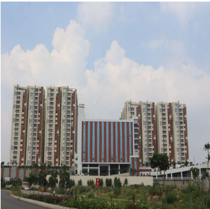
MY HOME VIHANGA - FINANCIAL DISTRICT