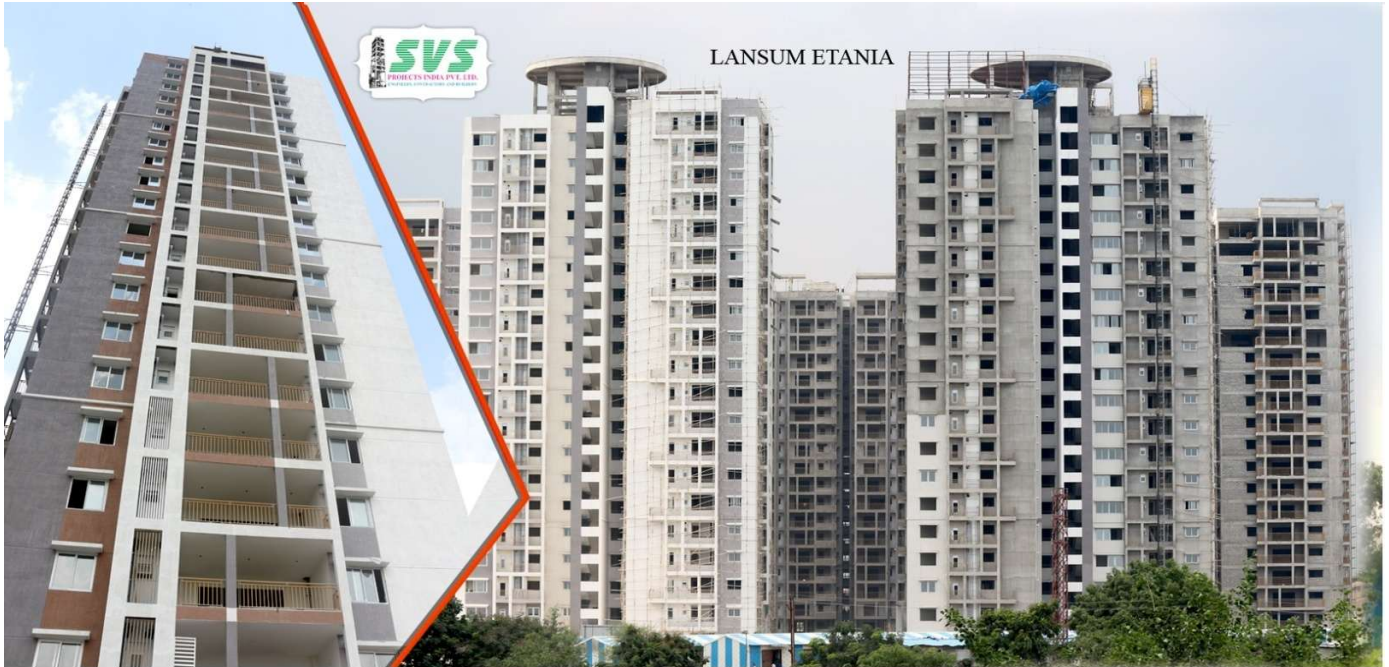
LANSUM ETANIA- NARSINGI-HYDERABAD